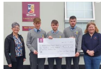
6th Year students presenting a cheque to Kerry Cancer Support Group