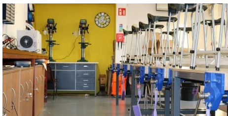
Upgraded technology and design room

The start of this year also saw the unveiling of a newly upgraded technology and design room for all practical subjects in the school. Below is a picture of the new space. More pictures of this room can be found on our website .