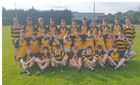
U15 Rugby Team

Our U15's have played a number of matches in the McCarthy Cup this year also. Finally, our first years had a rugby blitz in Tralee.