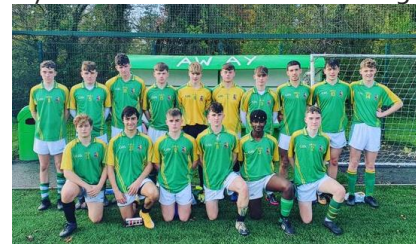
Senior soccer team who are currently unbeaten this year

The u17 team were already triumphant against Buttevant with a 3-2 win after extra time, they await confirmation of the next round. Unfortunately, the U15 game could not be fulfilled and so our boys progress to the next round where they will make their maiden outing.