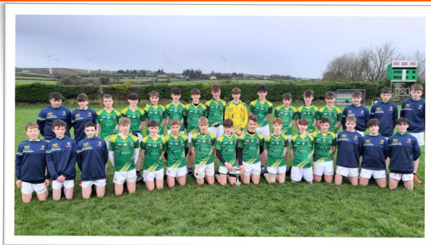
U15 Football team who won the Munster Final