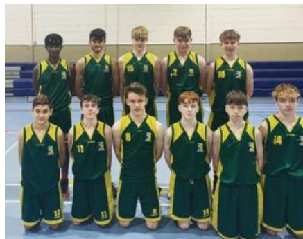
Under 16 A Basketball team

Our U19 basketball team bowed out of the All-Ireland 'A' Cup in the opening round at the hands of St. Pauls, Oughterard but rebounded to secure a dramatic overtime victory over Scoil Pobail, Sliabh Luchra Rathmore in the South-West League. With two league games remaining to play we are hopeful we can progress to the league play-offs.