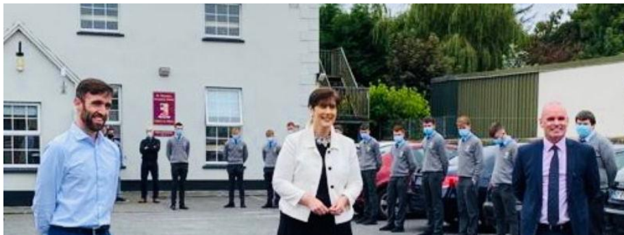
Minister Norma Foley Education & Skills visiting our school on the 3rd of September

This school year had a very exciting start with a visit from Minister of Education & Skills Norma Foley on the 3 rd of September to Leaving Certificate students who were collecting their results. On the day the Minister spoke to the current cohort of Leaving Certificate students.